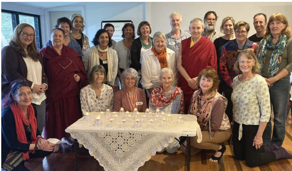
Cittamani staff and other community members share a reflective moment at the three day course at Chenrezig Institute.